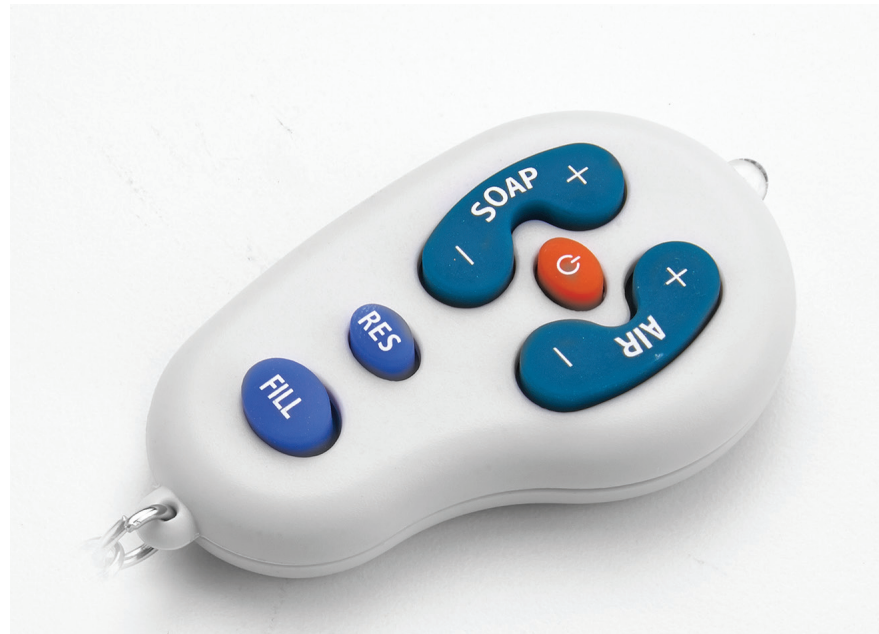
EZFILL™ FOAM REMOTE CONTROL

REMOTE CONTROL FOR ALL MODELS 0393-(n) and 0394-(n) Vanity Mounted Automatic Foam Soap Dispensers