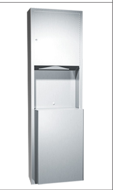
Scan for Information