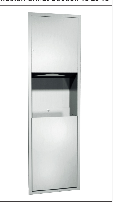
Scan for Information