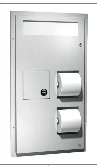
Scan for Information