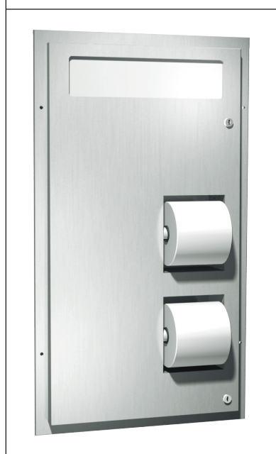
Scan for Information