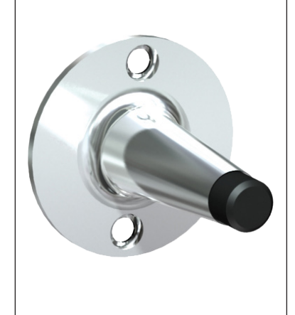
Scan for Information