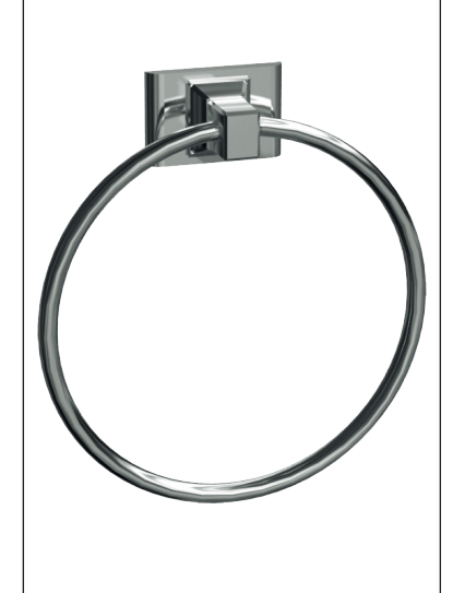
Scan for Information