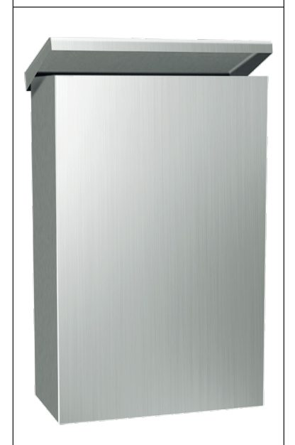
Scan for Information