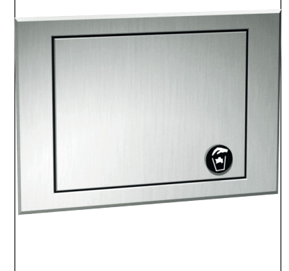
Scan for Information