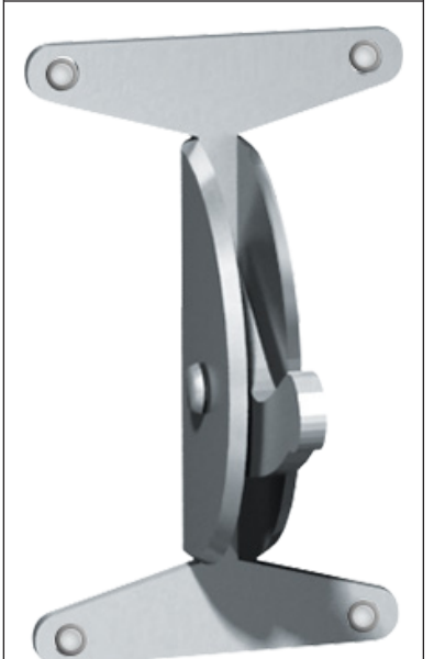
Scan for Information