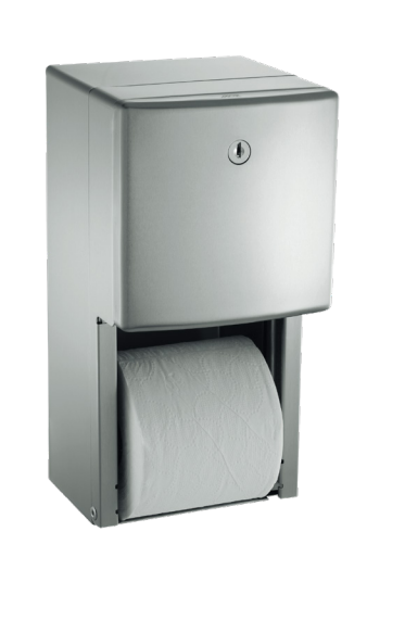
Scan for Information