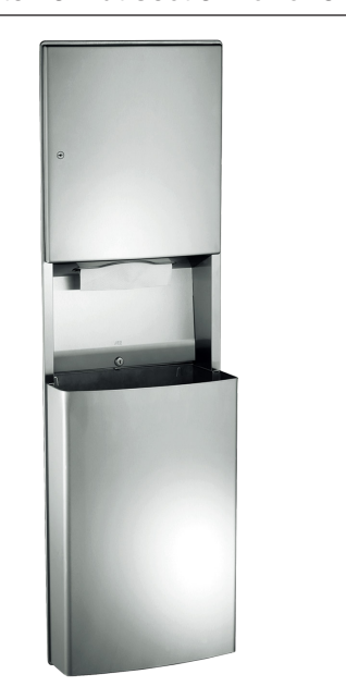
Scan for Information