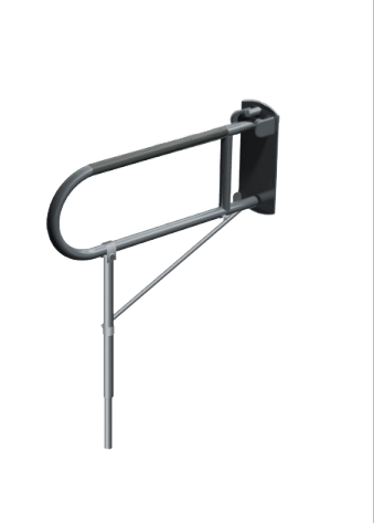
Scan for Information