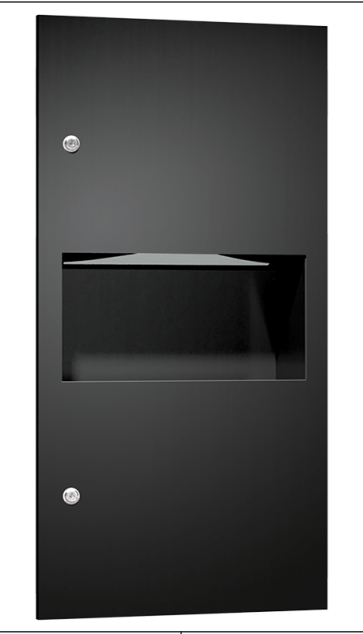
Scan for Information