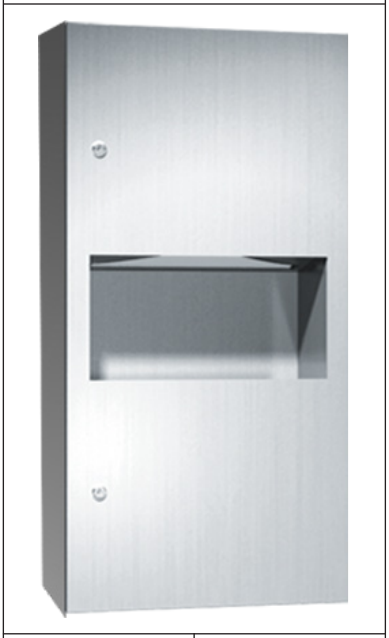
Scan for Information