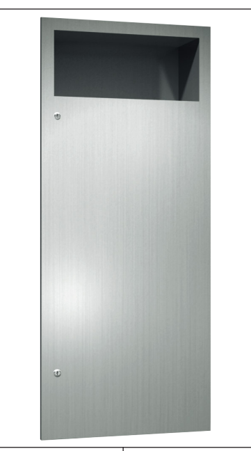
Scan for Information