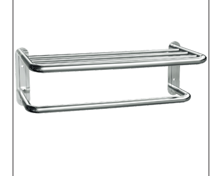
Scan for Information