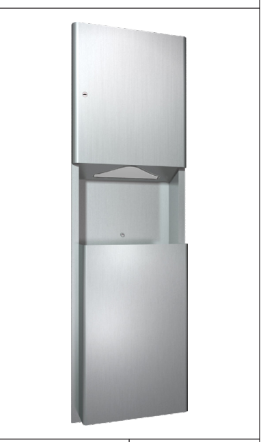
Scan for Information