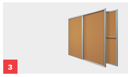
Pick your Configuration Select from vertical or horizontal sliding configurations that can be delivered pre-framed or unassembled.

Fabric Tac® Tackboards Vinyl Tac Tackboards Forbo® Tackboards