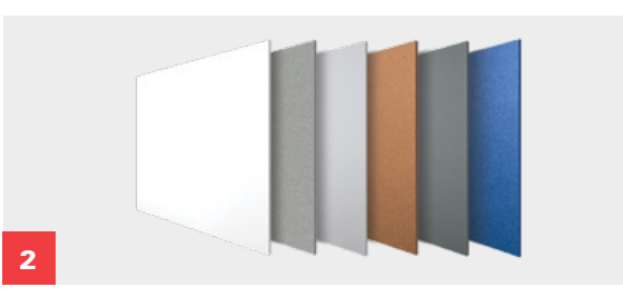
Pick your Surface Select from a variety of writing and tackboard surface options.

Porcelain Writing Surfaces Glass Writing Surfaces Cork Tackboards