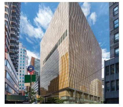
NEW YORK-PRESBYTERIAN DAVID H. KOCH CENTER NEW YORK, NY ARCHITECT: HOK