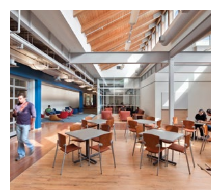
UNIVERSITY OF CT HEALTH CENTER FARMINGTON, CT ARCHITECT: GOODY CLANCY