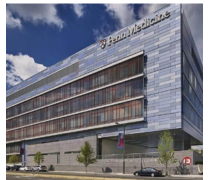
PRESBYTERIAN MEDICAL CENTER PENN REGIONAL PHILADELPHIA, PA ARCHITECT: EWING COLE