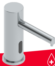
0390-HSD High Capacity Hand Sanitizer Dispenser

* Dispenser is installed on site using pre-drilled holes